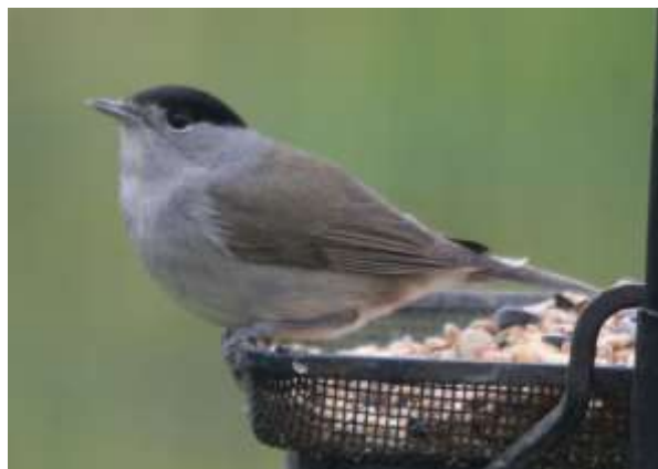
Check out other bird photos by members on the website.