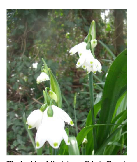
The Loddon Lily